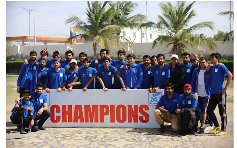
A group photo of the winning team (4th year).

The sports week concluded with an award ceremony with great appreciation and applause for every sportsman.