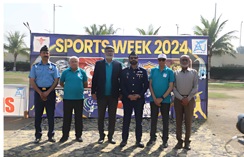
The Base Commander of PAF Base Faisal with Principal and Vice Principal of FRPMC.

The Base Commander of PAF Base Faisal inaugurated the sports event. Addressing the participants, he said that sports made students better human beings, taught tolerance, and encouraged the spirit of competitiveness. He administered the oath to the sports teams and formally declared the commencement of the 2024 sports gala.