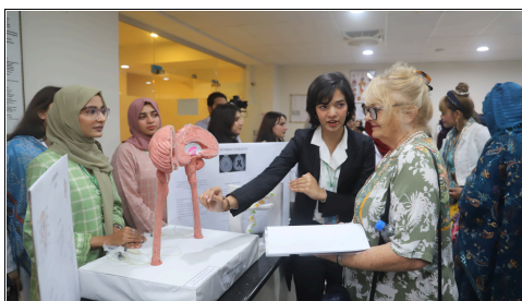
Model and poster presentations from students drew admiration from speakers and attendees alike.