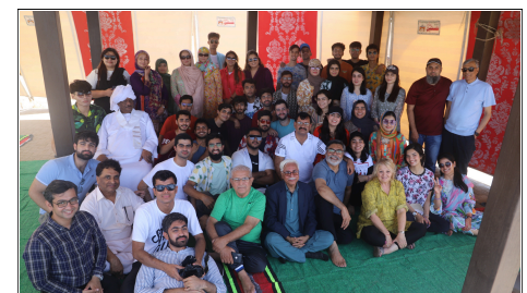
Along with this rich scientific program, there were social gathering, dinner, ethnic music and picnic to celebrate the diversity of Karachi.