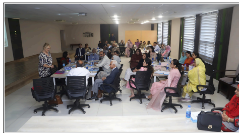
Several preconference workshops were held at different medical colleges of Pakistan.